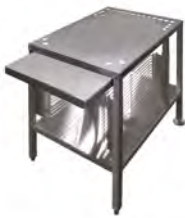
UNISTAND 25 & UNISTAND 34