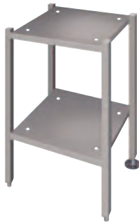
Double Stack Stands